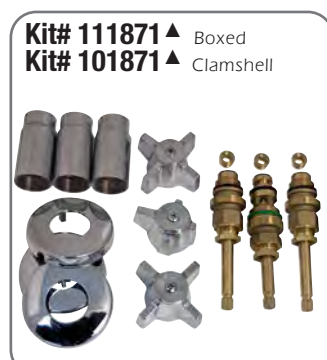
Kit# 111871▲ Boxed Kit# 101871▲ Clamshell