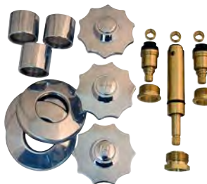
Kit# 111881▲ Kit# 101881▲ Clamshell

Genuine: 130420_072950-1700AP - hot 130470_072951-1700AP - cold